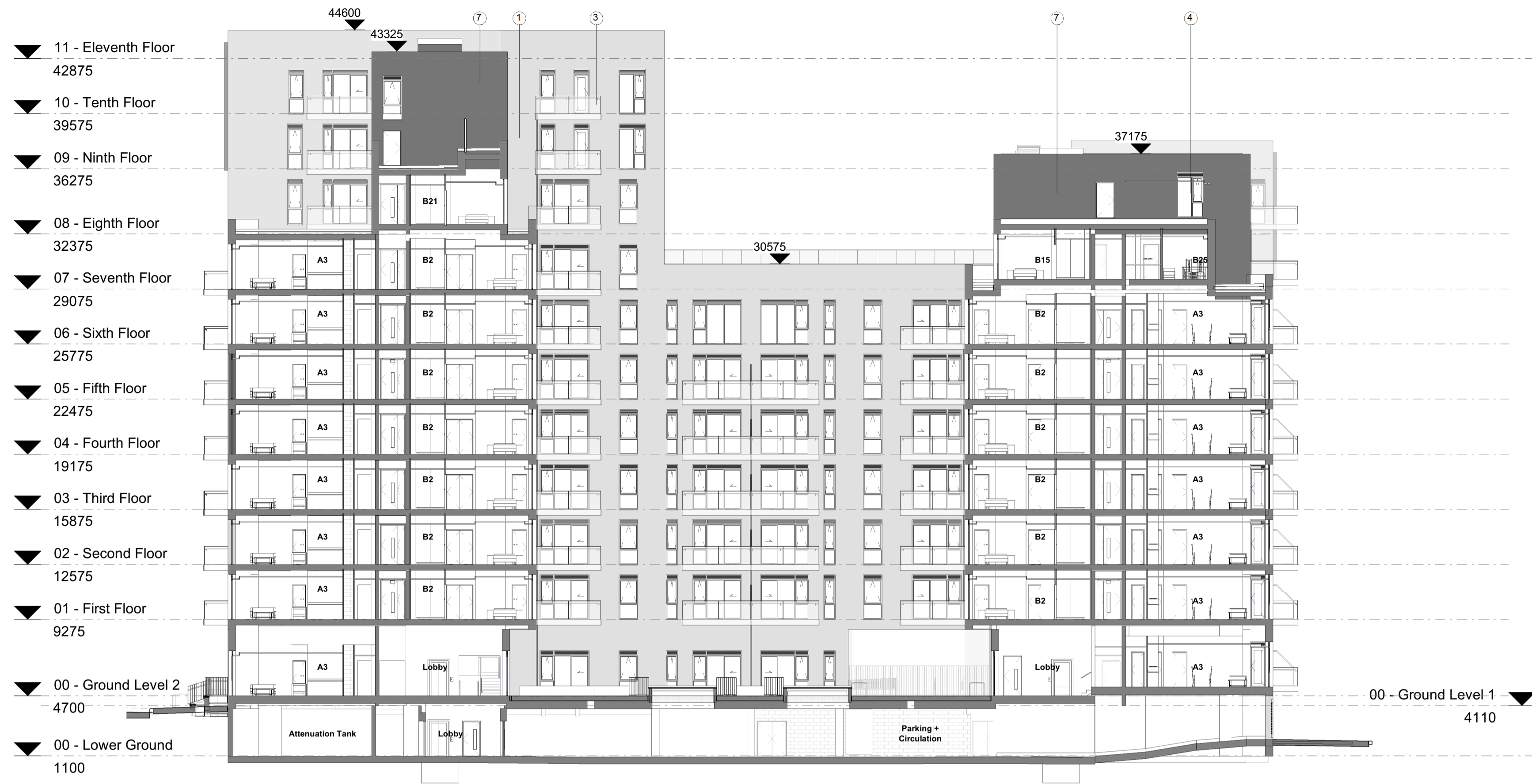
1 Block 2 - Section E-E 1 : 200

NOTE ALL DIMENSIONS TO BE CHECKED ON SITE NO DIMENSIONS TO BE SCALED FROM THIS DRAWING THIS DRAWING IS TO BE READ IN CONJUNCTION WITH RELEVANT CONSULTANTS DRAWINGS